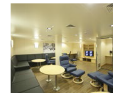
Public spaces – leisure area