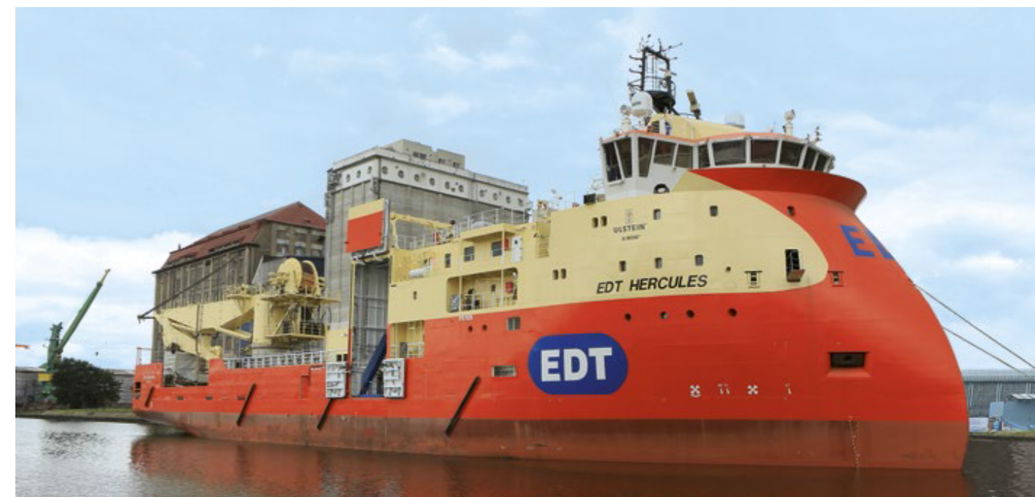
EDT Hercules - platform supply vessel