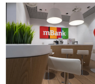
Customer assistance points