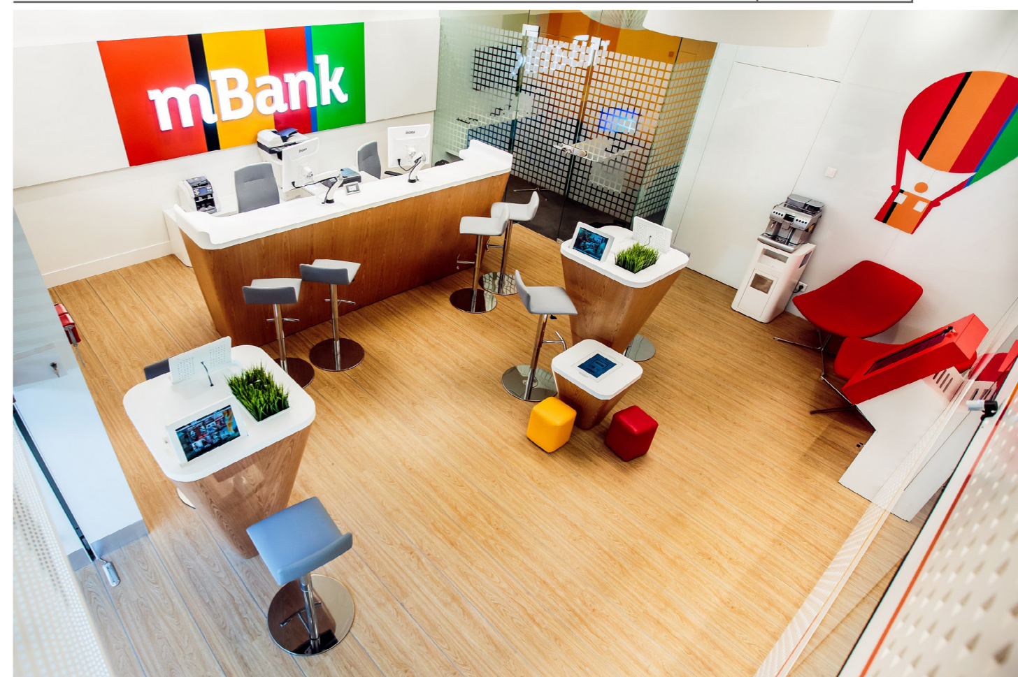
Retail service store